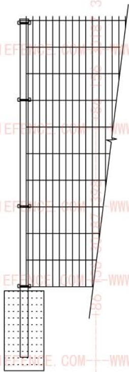
TYPE-1 BURIED FOUNDATION